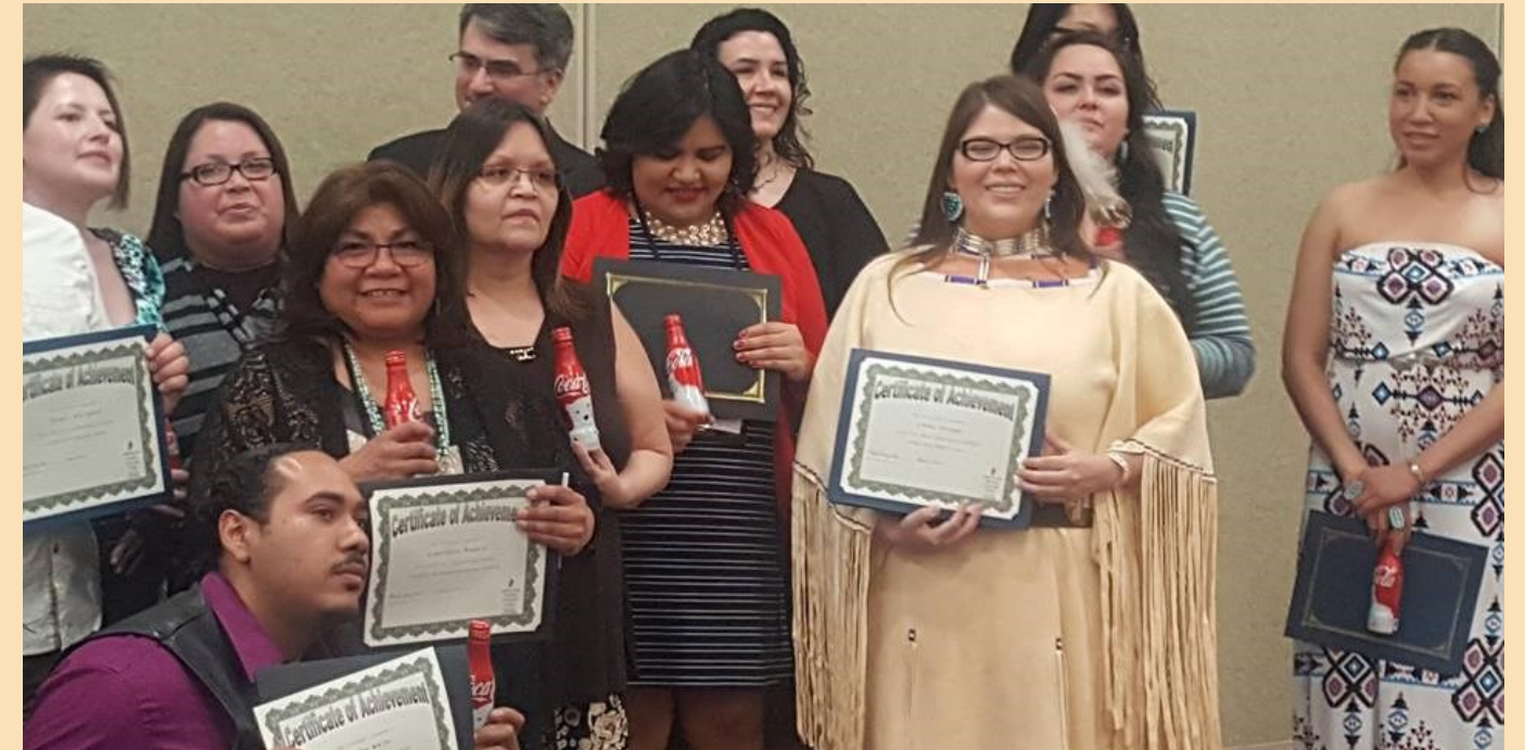
Coca Cola Scholars 2017